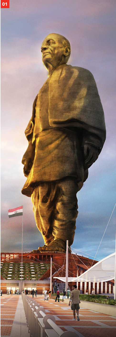
01 Statue of Unity Narmada Sarovar Dam, Gujarat MEP, Structures, Infrastructure, Geotechnical, Facade, Fire Safety, Vertical Transportation Client: Government of Gujarat